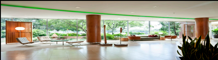
Above: Hotel Lobby