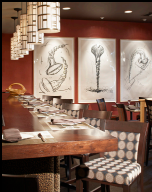
Below: Art Bar (Left), Pool & Spa (Right)